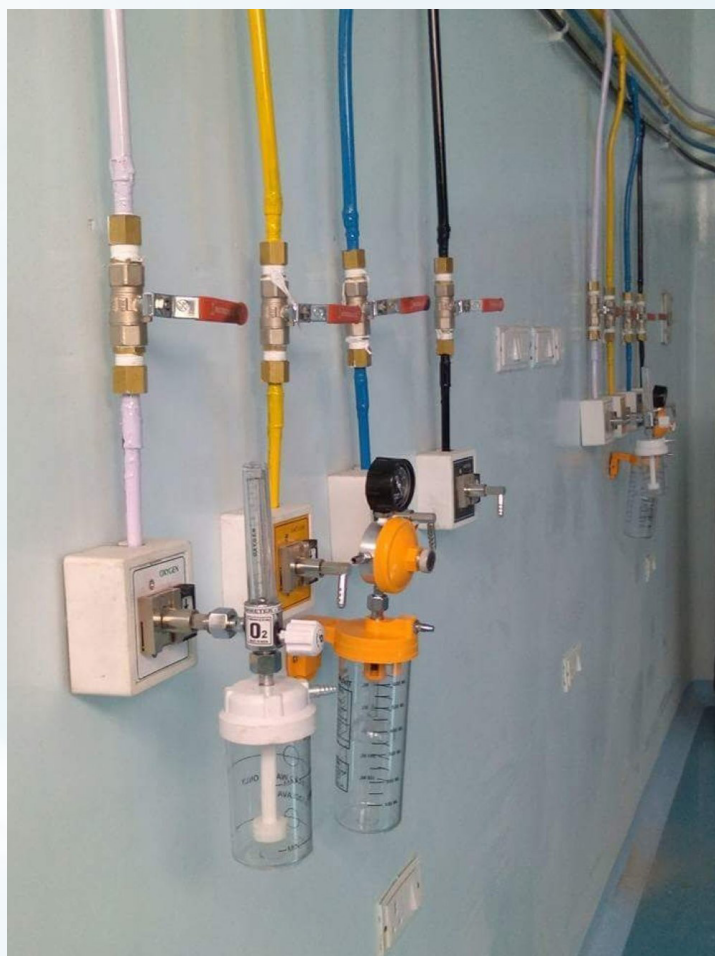
Our Work Examples

Safety Compliance, Testing & System Audits- Safety compliance is central to oxygen pipeline maintenance. Our audits verify system integrity, labeling, emergency shut-off functionality, and adherence to hospital engineering standards.